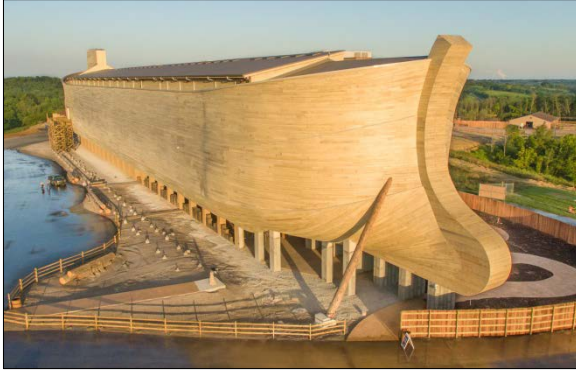
Photo of Ark replica. www.arkencounter.com